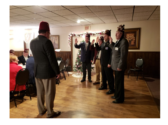
Adirondack Shrine Club Installation