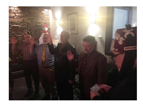
Motor Patrol Installation