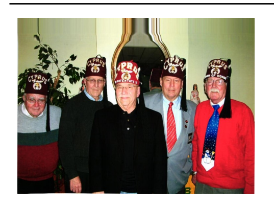
Greene County Shrine Club Installation