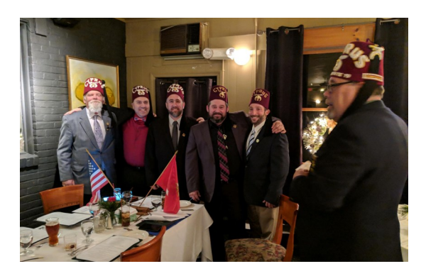
Ulster County Shrine Club Installation