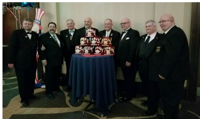
NYOSA Potes at Oriental's Ball