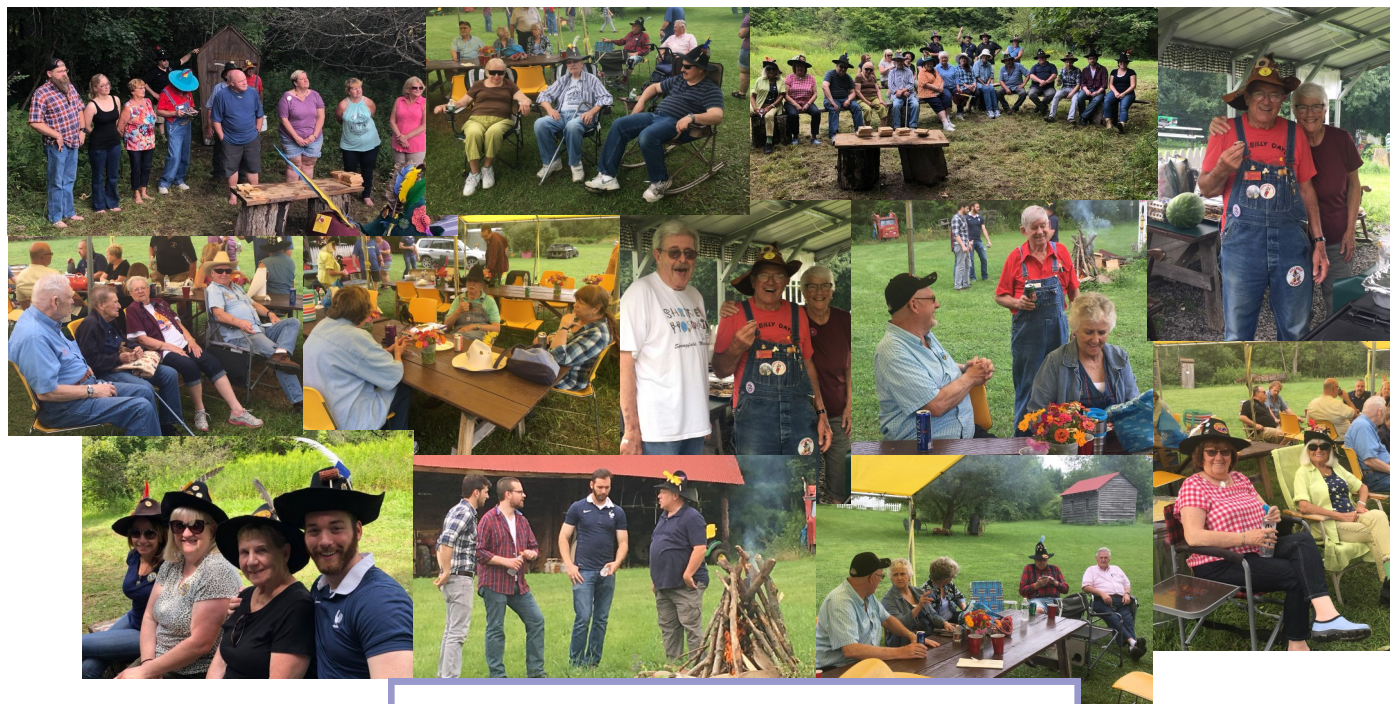
Rip VanWinkle Hillbilly Clan Picnic and Initiation