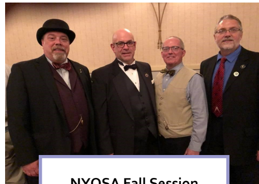
NYOSA Fall Session