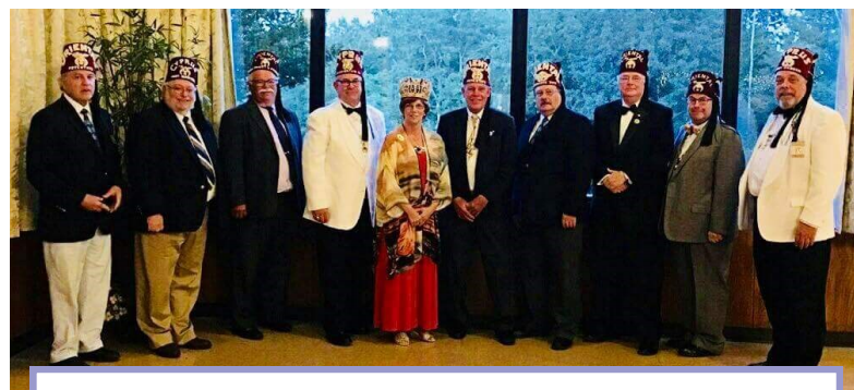
Visit of the Supreme Queen, Daughter of the Nile