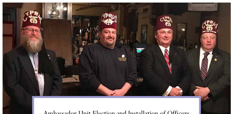
Ambassador Unit Election and Installation of Officers