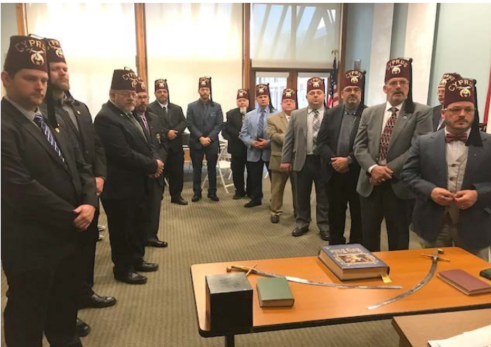
Cyprus' Newest Nobles at the Ceremonial

President and Cyprus Noble FDR's Original Application to become a member of Cyprus Temple