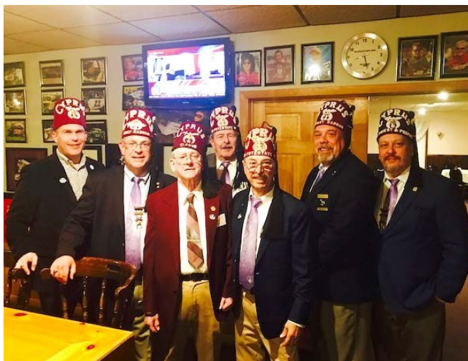
The Potentate and the Elected Divan visit the Adirondack Shrine Club.

When Allah calls, then our friends obey, And fold their tents and steal away, To the land where the crystal waters flow, Where the beautiful Palms of Allah grow.