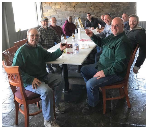
Work Party at the New Shrine Center